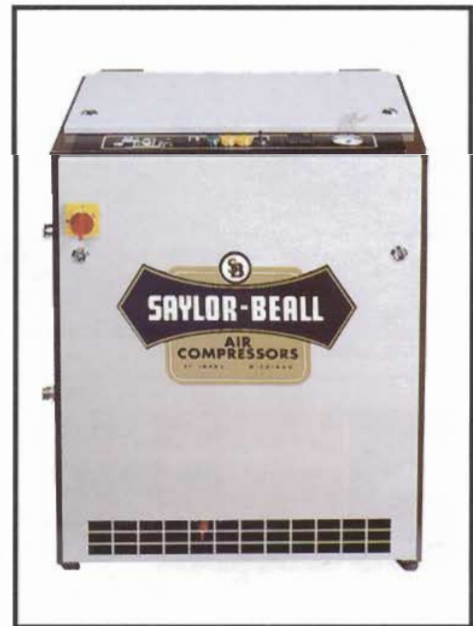
10 H.P. Model TMR 10

Available on 10 to 50 horsepower models.