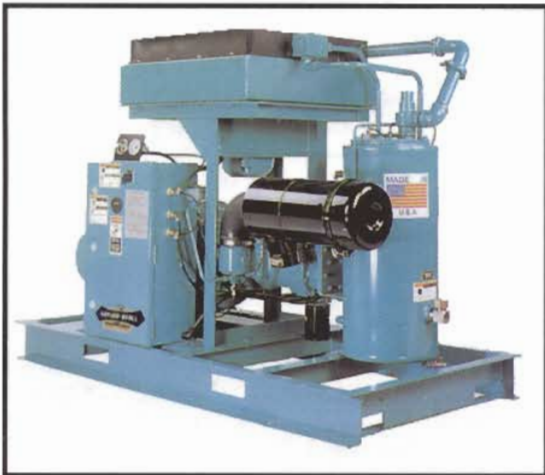
50 H.P. Model RSD 50V

Updraft cooling routes air vertically to save space and help dissipate heat. Two horsepower motor cooling fan is separate from the compressor.