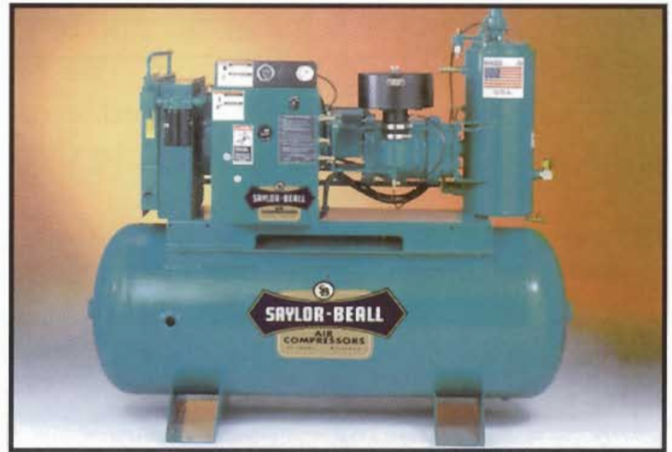
25 H.P. Tank Mtd. Model RSD 25

Available on 15 to 40 horsepower models.